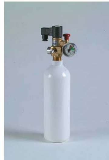
Fireraser Storage Container

Fireraser containers are suitable for use at storage temperatures of +32°F to +120°F (0°C to 48.9°C) with HFC-125 and +32°F to +130°F (0°C to 54.4°C) with FM-200. Each container is shipped from the factory fitted with an anti-recoil device installed on the discharge valve outlet in accordance with USDOT requirements. The anti-recoil device ensures the contents of the pressurized container will be released in a slow, controlled rate of discharge if the valve is opened during the shipping and handling process.