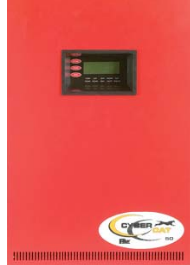
Fike CyberCat 50

These devices use the SLC signaling line circuit to exchange status information with other devices as well as with the control panel. When an input is activated, it is configured to cause its associated zone to enter into an operational state. Any detection device will cause its associated zone to enter into an alarm state. The output devices are configured to activate to protect and evaluate the endangered zone. This system is completely modular, allowing you the flexibility to design a system that is just right for your application. A typical configuration is shown on page 2 that illustrates the communications of a CyberCat 50 system.