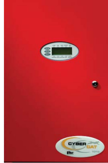
Fike CyberCat 254

These devices use the SLC signaling line circuits to exchange status information with other devices as well as with the control panel. When an input is activated, it is configured to cause its associated zone to enter into an operational state. Any detection device will cause its associated zone to enter into an alarm state. The output devices are configured to activate to protect and evaluate the endangered zone. This system is completely modular, allowing you the flexibility to design a system that is just right for your application. A typical configuration is shown on page 2 that illustrates the communications of a CyberCat system.